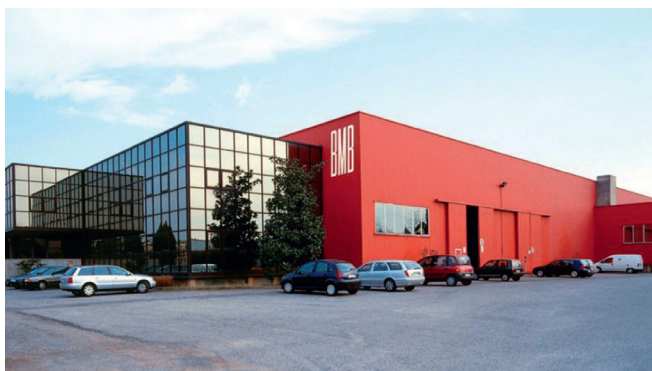
BMB's main production facility in Brescia, Italy

Located in the industrial heartland of Brescia in Northern Italy, BMB S.p.a. is a leading global manufacturer of injection molding machines for the plastics industry. Founded in 1967, the company has an annual turnover of €114m and around 170 employees. At its headquarters in Brescia, BMB has three main production facilities organized into four units, responsible for building its range of hydraulic, hybrid and full electric injection molding machines such as the eMC full electric and the eKW hybrid.