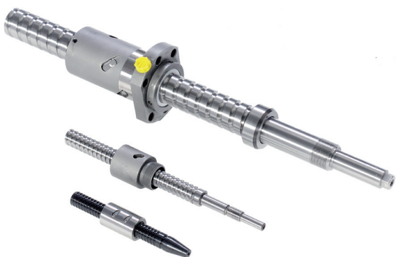
Moog Ball and Planetary Roller Screws

Moog's further, successful collaboration with BMB highlighted how close cooperation with the customer can bring tangible and positive results. Since 2016 BMB have ordered a high number of roller screws from Moog for use on both injection and clamping axes, demonstrating how the company now feel comfortable interfacing with a single high technology supplier for multiple products. Switching to Moog as a key supplier of roller screws has enabled BMB to acquire high quality, reliable and customizable technology at a realistic price. As a result, they are now able to engage in production planning more effectively while reducing the volume of products in their warehouse. For Moog, it is ample confirmation of how in-house expertise leads to product improvements, and how excellent relations with customers deliver real advantages to the manufacturing process.