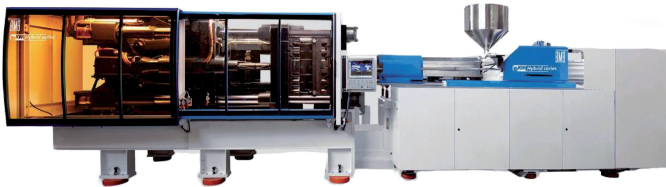
BMB's eKW Hybrid Injection Molding Machine – clamping axis on the left of picture

This positive collaborative engagement also enabled Moog significantly to improve on the delivery time offered by its competitors, thereby helping to resolve BMB's supply problems. The project as a whole clearly demonstrated how effective collaboration and continuous product improvement delivers manufacturing success.