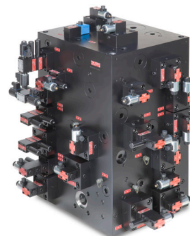
Hydraulic Manifold Systems and Cartridge Valves