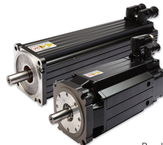
Brushless Servo Motors