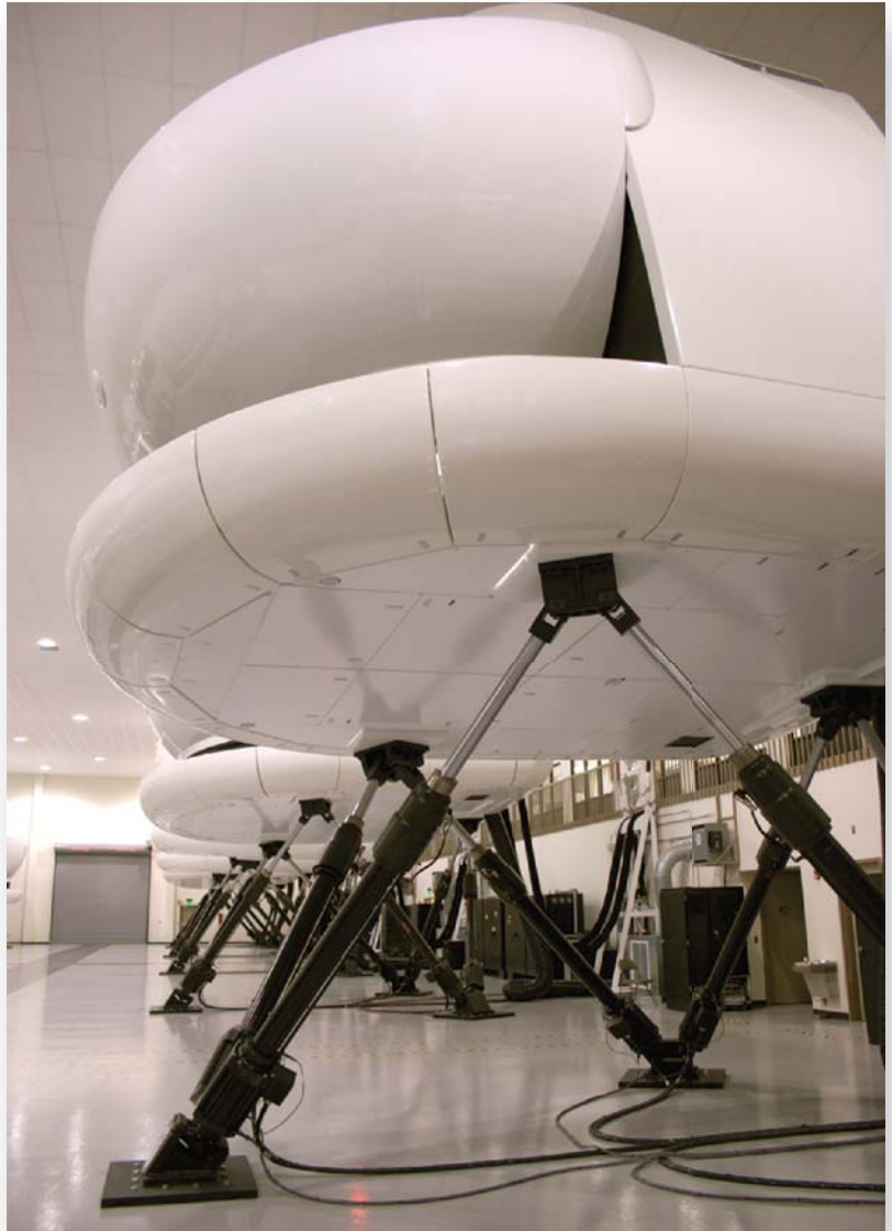
The underside of a FlightSafety International full-flight simulator shows the six electric linear actuators that move the “cockpit” of the simulator to replicate the flying parameters of various aircraft. The hexapod arrangement lets the cockpit travel through six degrees-of-freedom (6DOF) .

Though hydraulic motion-control systems met the performance specifications for full-flight simulators, all-electric systems offer several advantages over hydraulic motion control such as higher energy efficiency, higher uptime from lower maintenance, and a less-costly infrastructure. Hydraulic infrastructures need a significant up-front investment. For example, trenches for hydraulic lines, hydraulic power rooms,